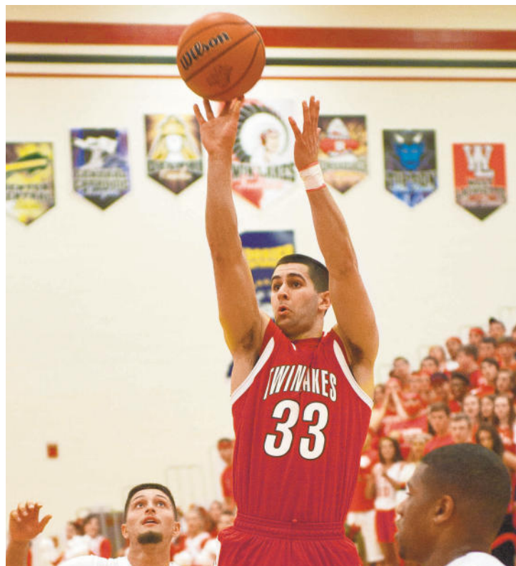
Twin Lakes and Western met for a boys basketball sectional championship in March. Beginning in the 2015-16 school year, they will be Hoosier Conference rivals.

May 8 school board meeting for Northwestern School Corporation, according to the agenda.