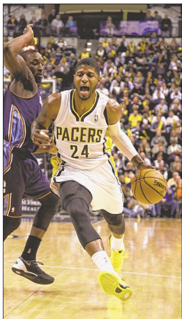
Indiana's Paul George drives around Ben Gordon.